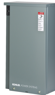
200 Amp with optional status indicator shown.