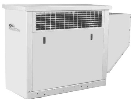
Weather Enclosure with Sound Kit